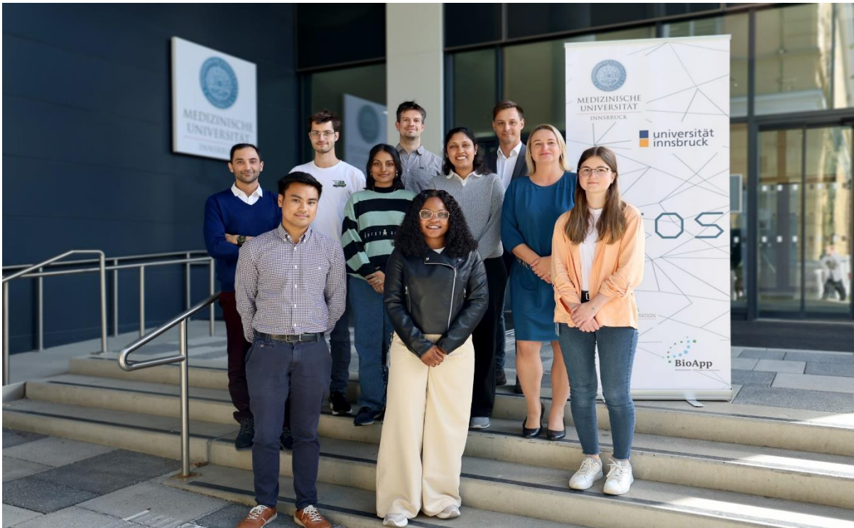
The MYCOS PhD Family: United in the Fight against Antifungal Resistance!

Their discussions emphasized how vital the students would be to the global effort to combat antifungal resistance. Following was a pleasant photo shoot to commemorate this significant occasion for the MYCOS family.